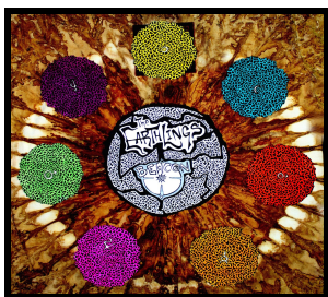
Beacon Δ 2016