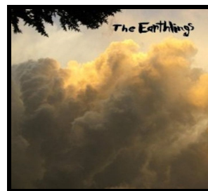
Tides Δ 2013